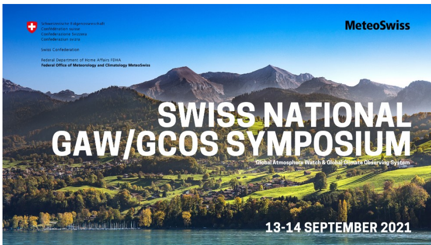
Figure 3: Official poster of the 1 st Swiss National GAW/GCOS Symposium 2021.