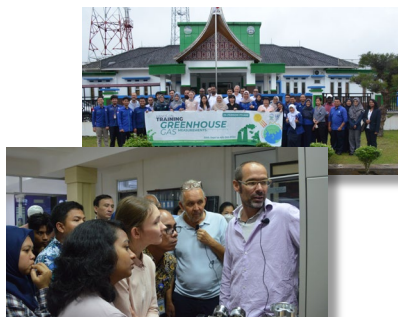
Training in Indonesia